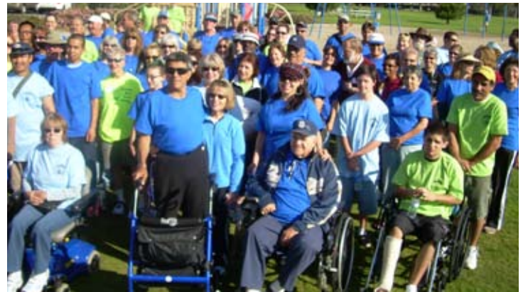
Students from the Acquired Brain Injury Program, Mesa College

This event is especially fun, as it is something everyone can do. It's a short walk, and any kind of walking is acceptable, even walking or doing supportive motion in place! Registration